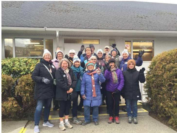
Members, friends, and husbands too...

What A Team Way to go CFUW PQ Ramblers We Raised $5615.00